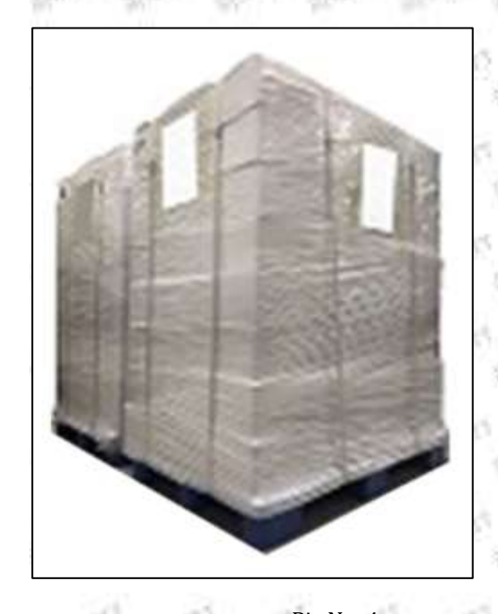
Pic No. 4

Pallet Shipping: Use pallet that meet export requirements, and use white wrapping protective film to wrap and bind with cable ties