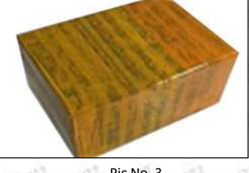
Pic No. 3 International express packaging: Wrapped with yellow tape after wrapping black protective film